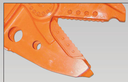
Waved shape cutter

Technical specifications subject to change without prior notice